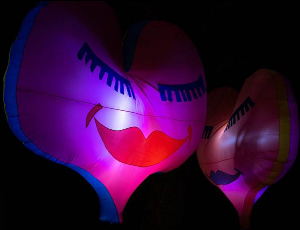
"Toof" by Bethany Neigebaur